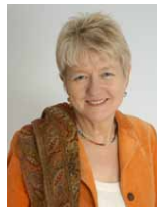
Ilona Kickbusch Chairperson of the World Ageing & Generations Congress

The Congress is an international and interdisciplinary platform used by decision-makers from all spheres of society and by a general audience that is fascinated by, intrigued with, and concerned about the consequences of global demographic shifts. Therefore, it is not only an educational event, but also insightful and thought-provoking.